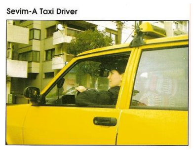
Figure 5. Women at men's work (New Bridge to Success)