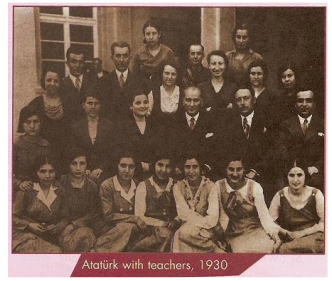
Fig 3. Images of women as teachers (Spotlight on English)

In contrast to males, females are mostly portrayed in subordinate roles. Nevertheless, some passages and visuals project positive images of women with whom female students can identify themselves (Figures 3, 4 and 5).