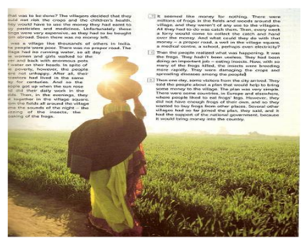
Fig 2. Representation of women in coursebooks (The people were poor, Life Lines)

unhappy girls, caring mothers, students, writers, and hardworking housewives. Among them, the hardworking housewife is the most popular image (Figure 2)